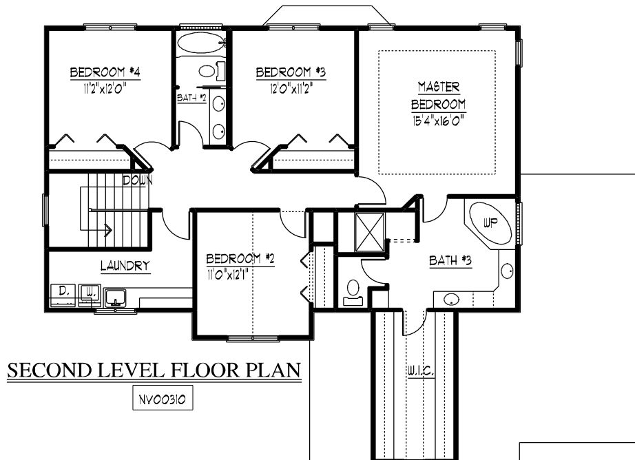
SECOND LEVEL FLOOR PLAN